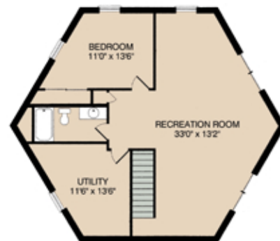
SPRUCE KNOB Optional Basement

Spruce Knob: Overall Dimension: 34' x 40' / Living Area: 1,003 sq. ft. / Total with Finished Basement: 2,006 sq. ft.