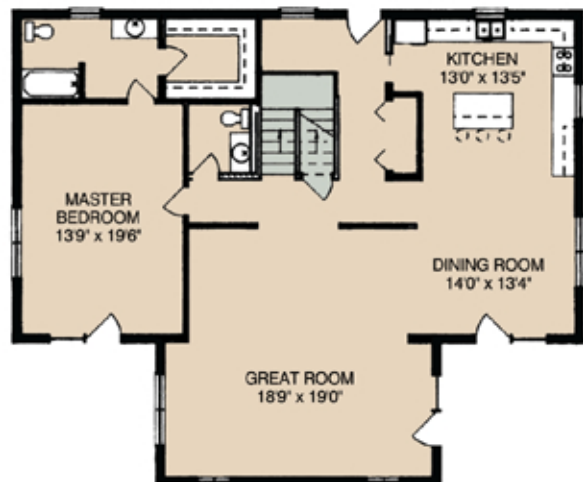
Main Floor Plan

The Monte Vista standard plan has three master suites and 2,382 sq. ft. Just add a full height foundation on a sloping lot with a touch of ingenuity and voila! Enjoy a five, six, or even seven bedroom home. Great for large families to get "back in touch." Decks and porches shown are optional.